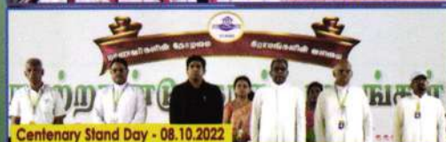
Centenary Stand Day - 08.10.2022