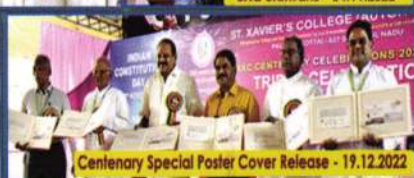
Centenary Special Poster Cover Release - 19.12.2022