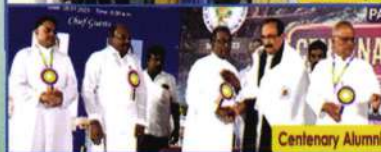
Centenary Alumni Congress - 28.01.2023