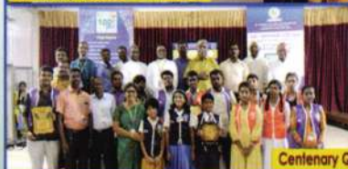
Centenary Quiz - 25.01.2023