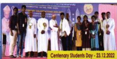
Centenary Students Day - 23.12.2022