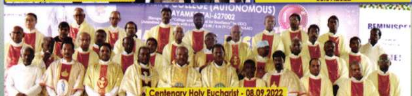
Centenary Holy Eucharist - 08.09.2022