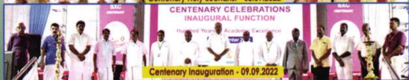
Centenary Inauguration - 09.09.2022