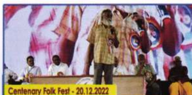
Centenary Folk Fest - 20.12.2022