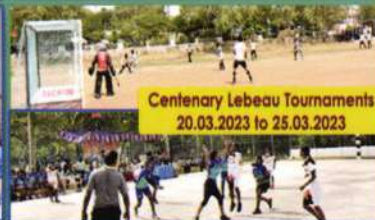
Centenary Lebeau Tournaments 20.03.2023 to 25.03.2023