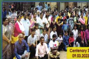
Centenary Staff Tour (GOA) 09.03.2023 to 12.03.2023