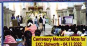
Centenary Memorial Mass for SXC Stalwarts - 04.11.2022